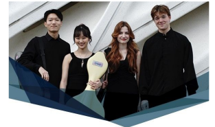
10TH ANNUAL "PLAY IT FORWARD CHAMBER RESIDENCY" FEATURING THE ODYSSEY STRING QUARTET

The Bellingham Festival of Music and the Bellingham Symphony Orchestra host the Odyssey String Quartet from the prestigious Colburn Conservatory in Los Angeles, for the 10th Annual Play It Forward Chamber Residency . The ensemble spends this week visiting our county schools, performing, teaching and inspiring our local music students. Hear these award-winning musicians in a public performance on Friday, March 8, 7pm at Sehome High School, 2700 Bill McDonald Pkwy, Bellingham. $15 suggested donation; students free.