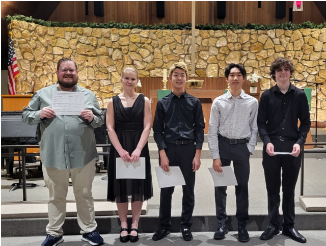
BMC H.S. String Awards