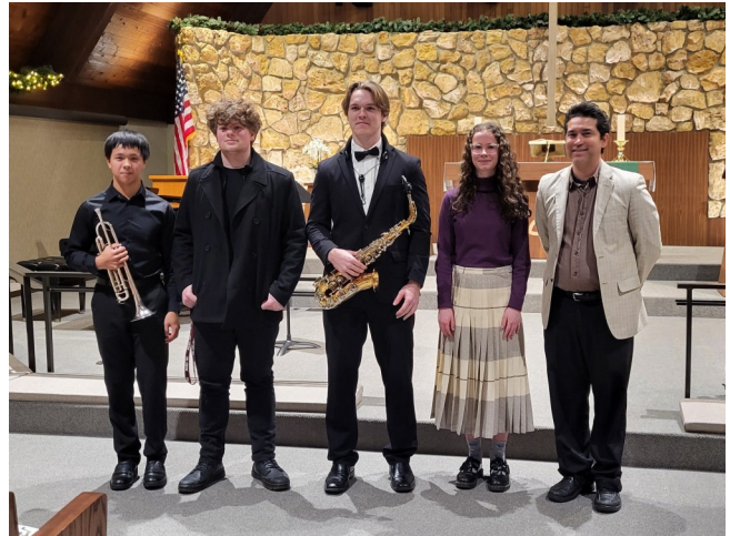
BMC H.S. Winds and Percussion Awards