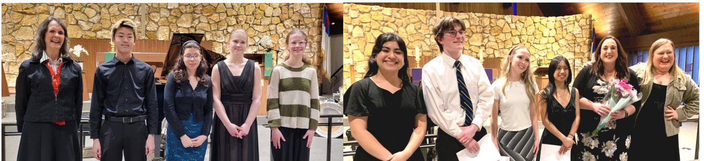
BMC H.S. Piano Awards