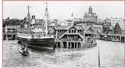
The “Princess Sophia” at Citizens Dock in 1916